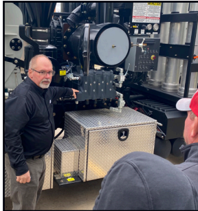
Hands-on Unit Evaluation