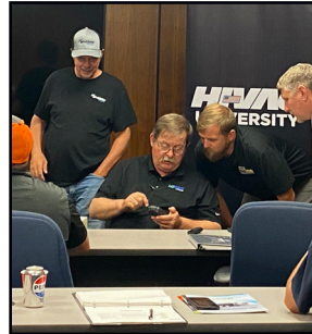
Detailed Systems Analysis