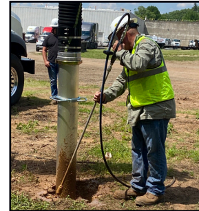
Live Operational Training